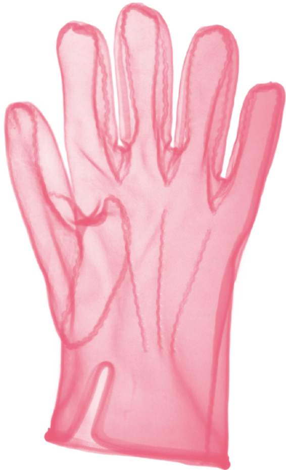
ULRIK HELTOFT REVERSED GLOVE , 2005, ROENTGEN PHOTOGRAPH, 30 X 21 CM, FRAMED 33 X 24 X 4 CM