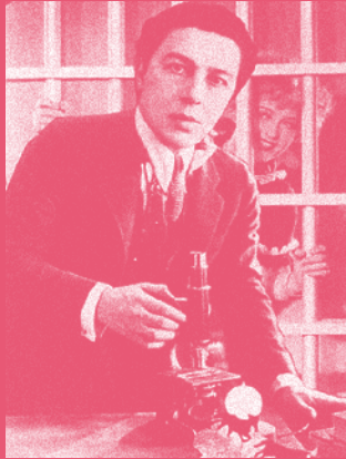
MAX ERNST, SCIENTIST OF THE STRANGE (PHOTOMONTAGE WITH ANDRE BRETON)

'My, that is a beauty!' Dr. Sanders reached forward to take the ornament she had exposed, but the woman held back his hands. Glittering below her in the sunlight was what appeared to be an immense crystalline orchid carved from quartz-like mineral. The entire structure of the flower had been reproduced and then embedded within the crystal base, almost as if a living specimen had been conjured into the center of a huge cut-glass pendant. The internal faces of the quartz had been cut with remarkable skill, so that a dozen images of the orchid were refracted, one upon the other, as if seen through a maze of prisms. As Dr. Sanders moved his head, a continuous font of light poured from the jewel.